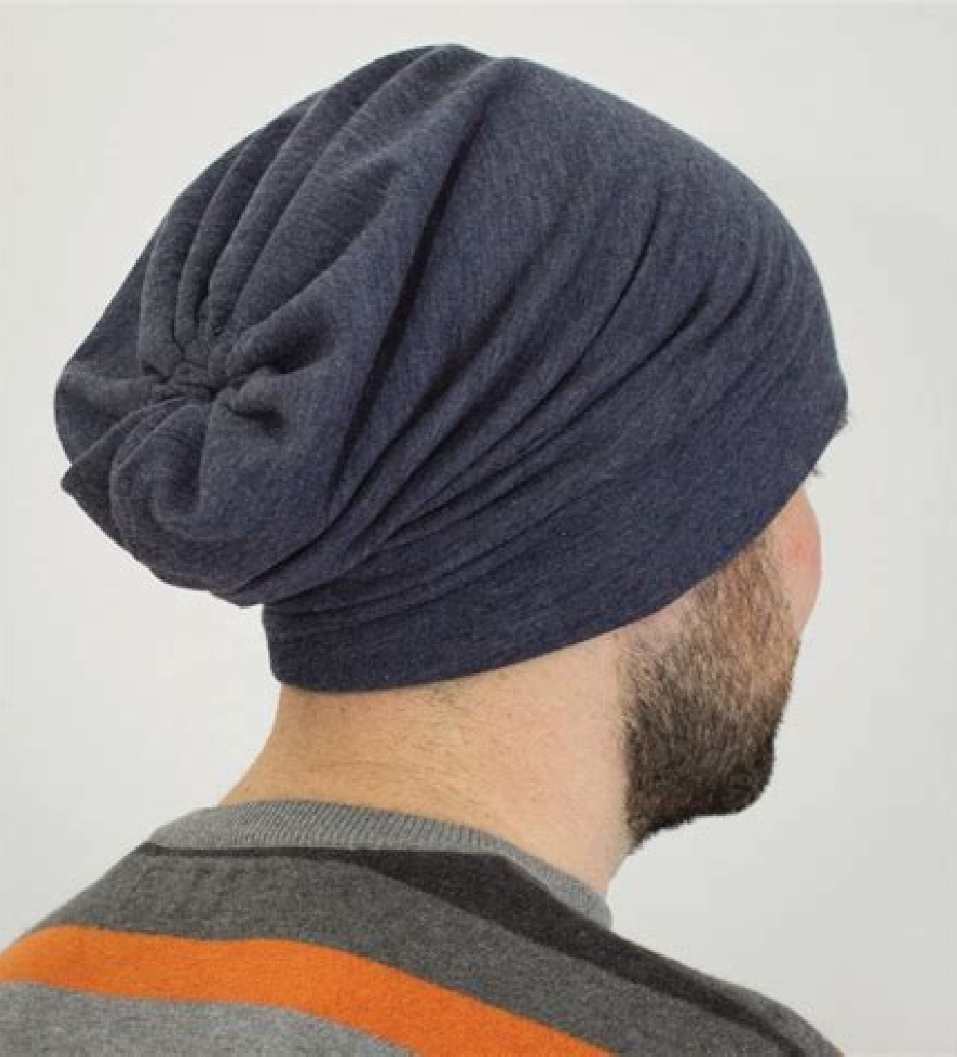
PDF PATTERN * Sina Renee