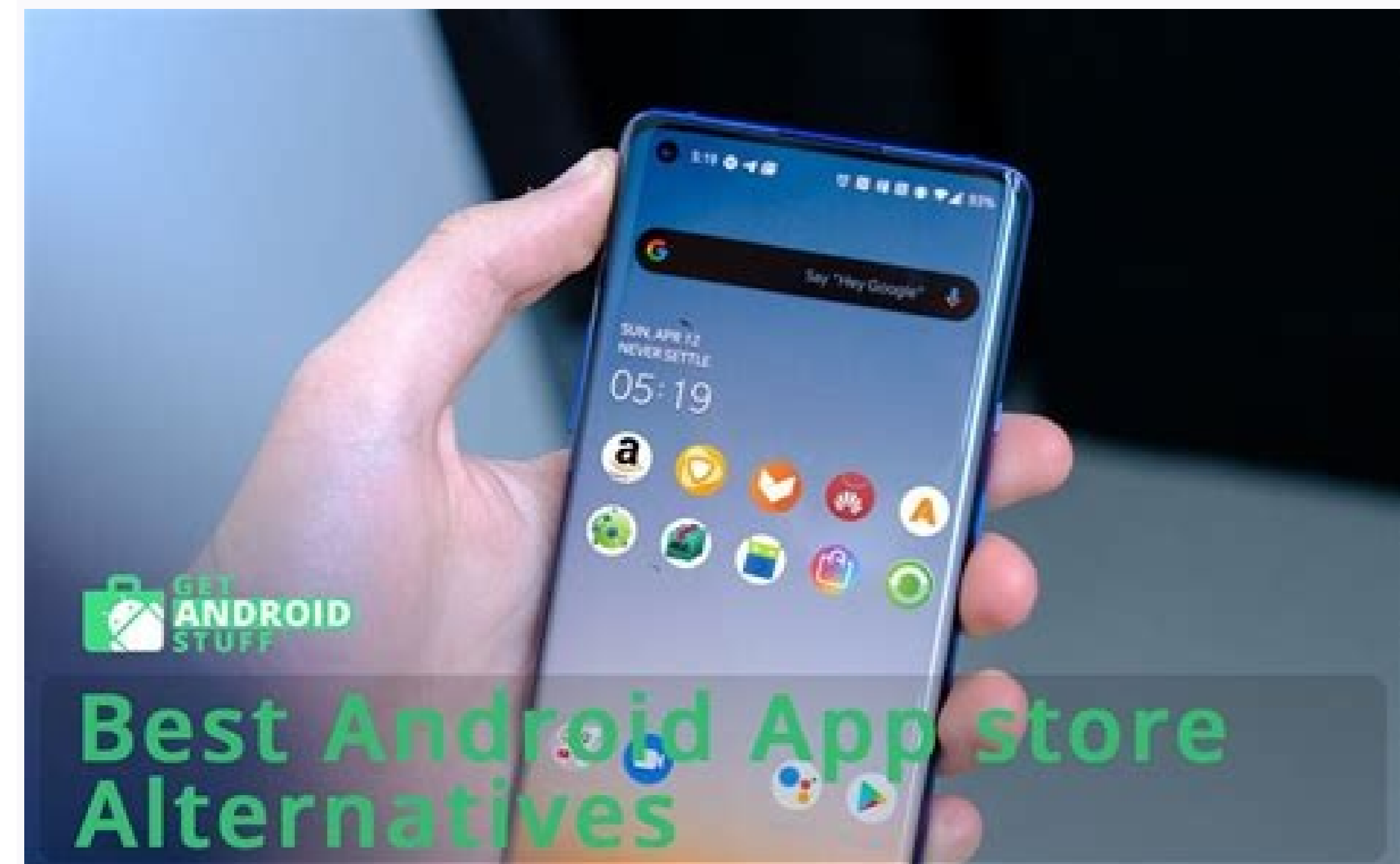
Other android app stores. Different app stores for android. How many app stores are there for android.