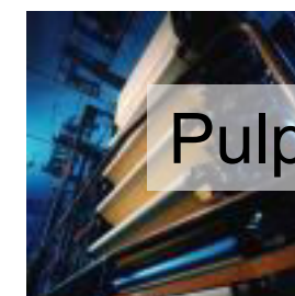
Pulp & Paper