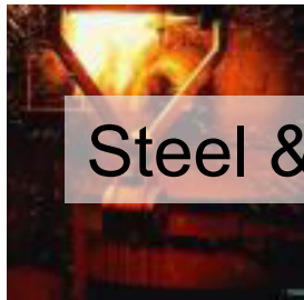
Steel & Foundry